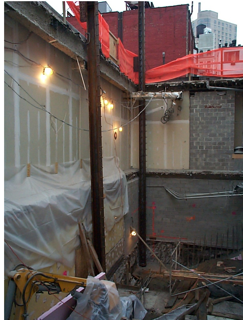
Concentrated Lateral System at Easement