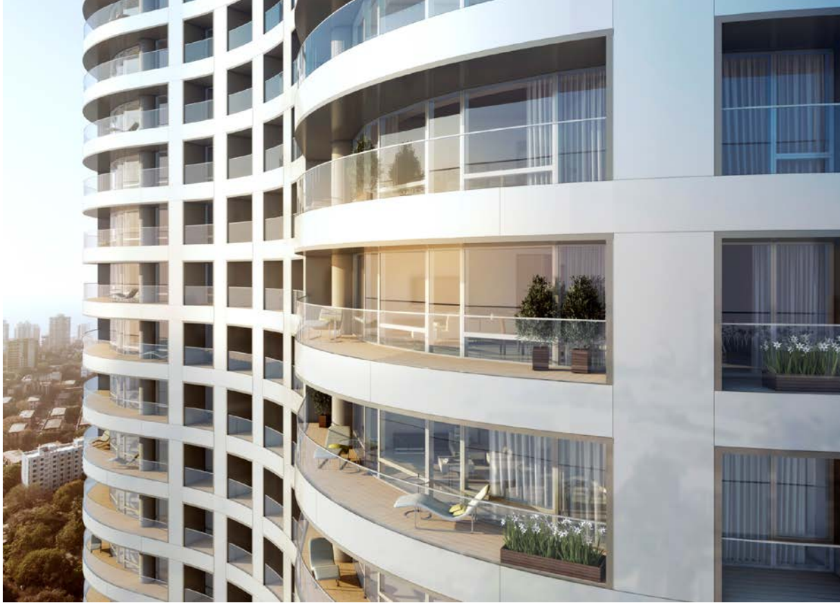
Lodha World One Tower Mumbai, India Pei Cobb Freed, Architect